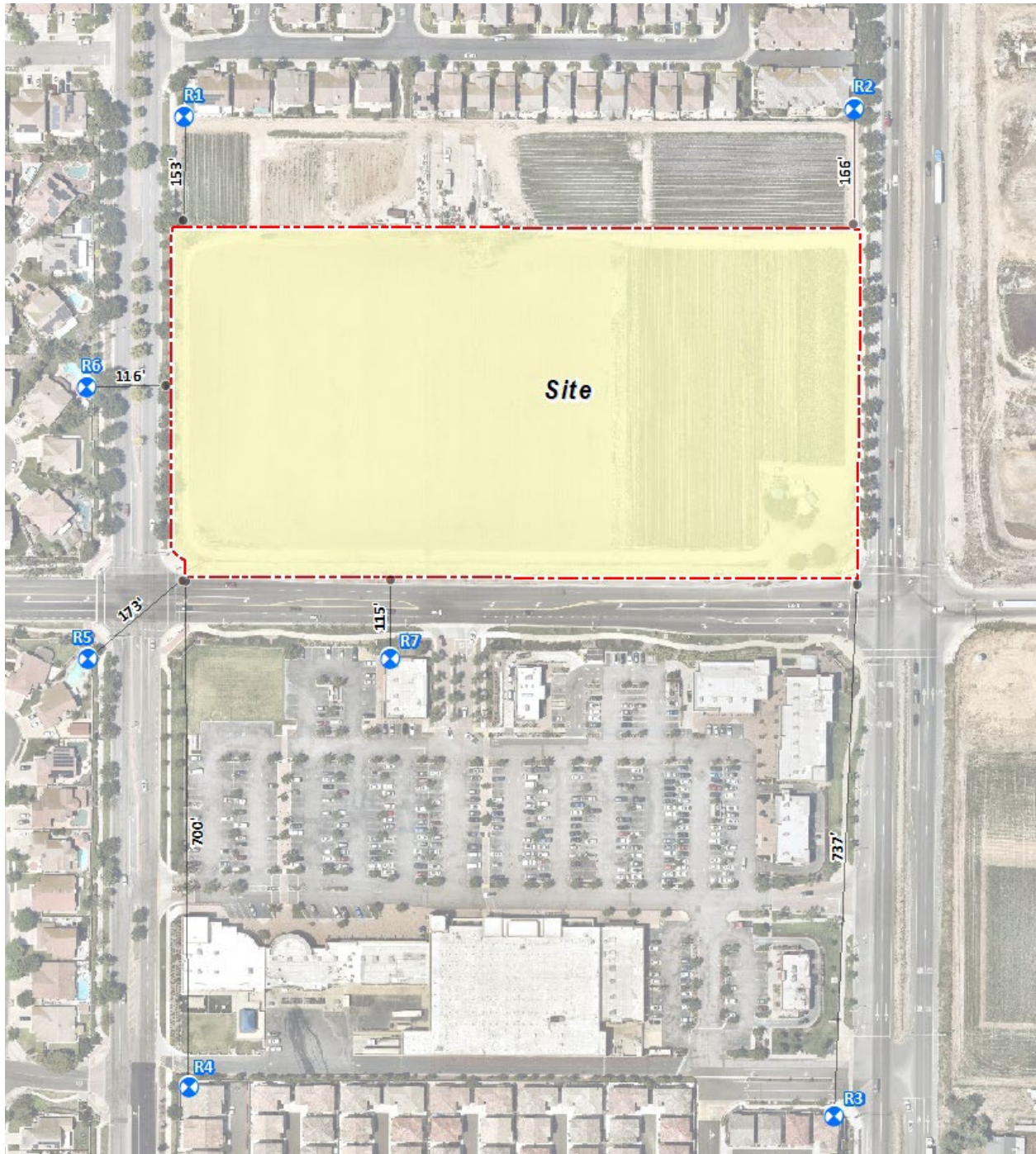
EXHIBIT 3-A: RECEPTOR LOCATIONS