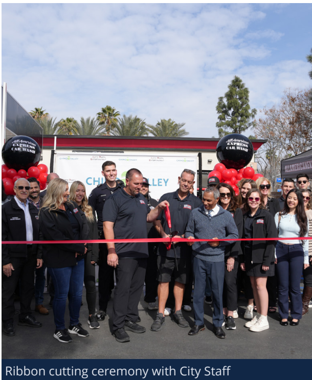
Ribbon cutting ceremony with City Staff

In many areas, General Plan implementation will depend on actions of other public agencies and of the private sector, which will fund most of the development expected in the next 20 years. The General Plan will serve a coordinating function for private sector decisions; it also provides a basis for action on individual development applications, which must be found to be consistent with the General Plan if they are to be approved.