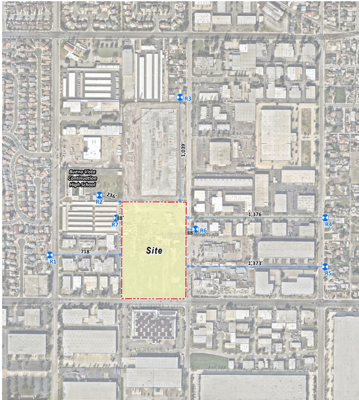
EXHIBIT 2: SENSITIVE RECEPTOR LOCATIONS